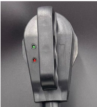
50 Amp Input Plug Indicators